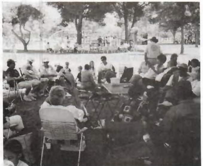
Laz'n in the shade...Bring on the food!