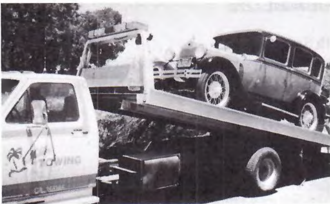
What some people will go through to get the Hard Luck Trophy!

There will be no car of the month for July.