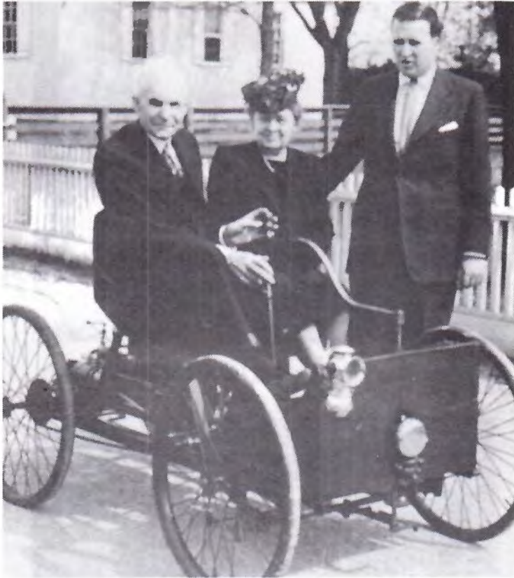
Henry, Clara, Henry II, and the Grandfather of the Model A.