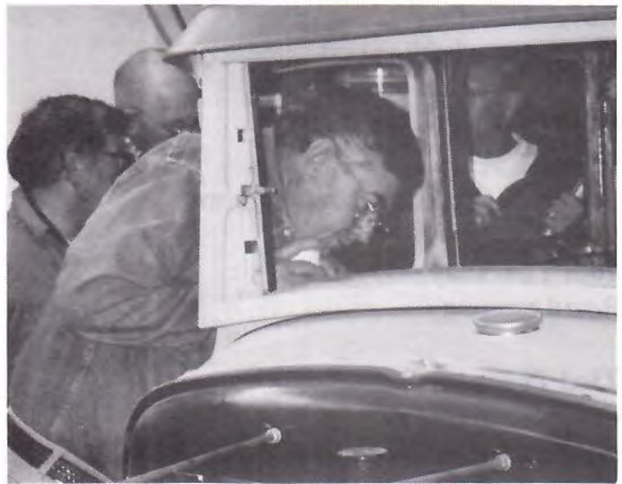
Calculating years 'til it's on the road.