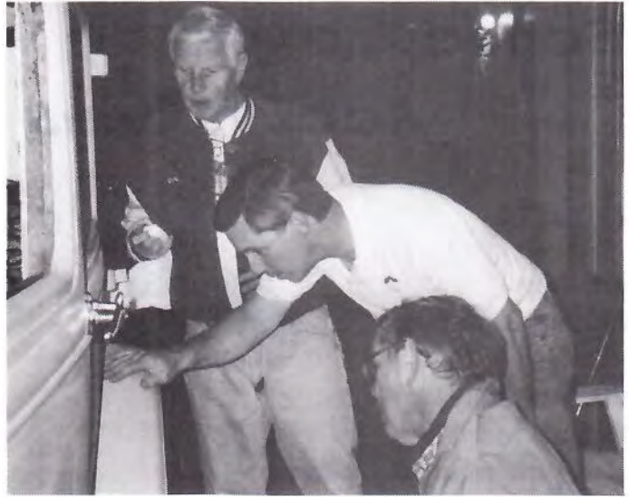
There's less wind noise if the doors close.